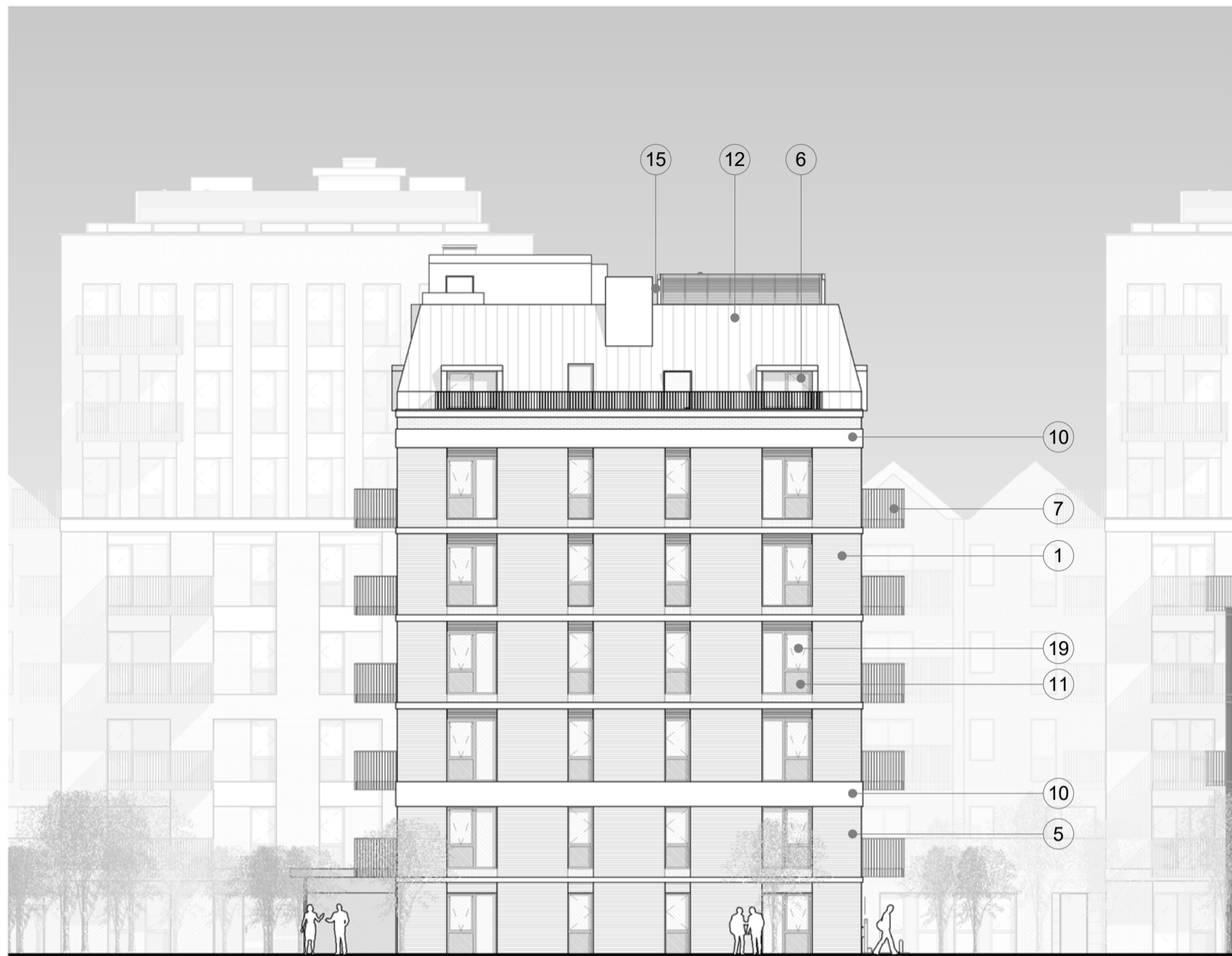
2 Building 10 - South Elevation 1 : 200