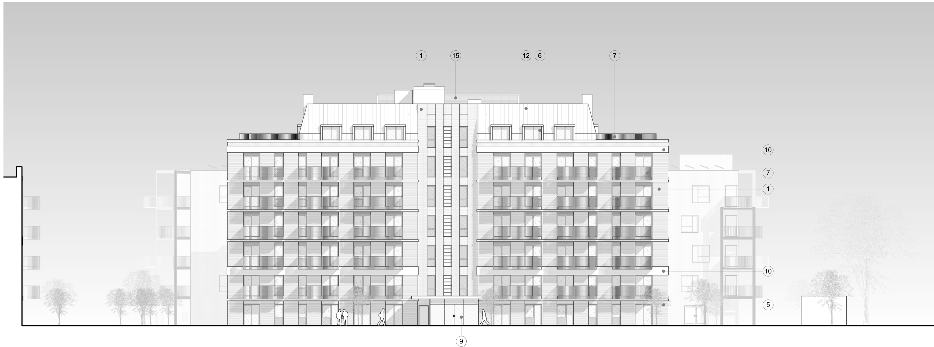
1 Building 10 - West Elevation 1 : 200