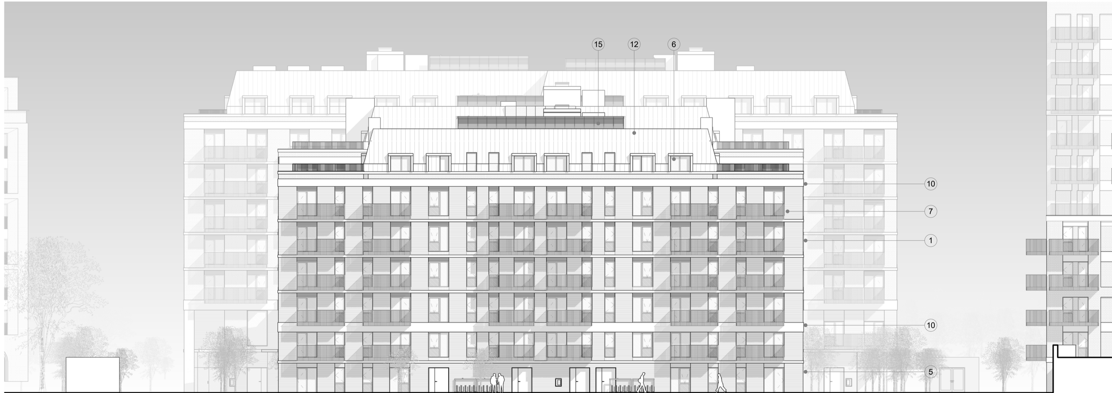
3 Building 10 - East Elevation 1 : 200