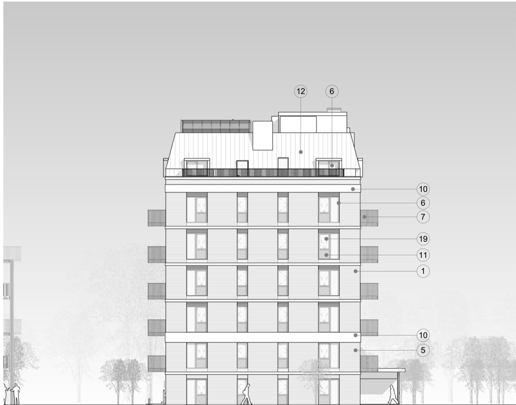
4 Building 10 - North Elevation 1 : 200